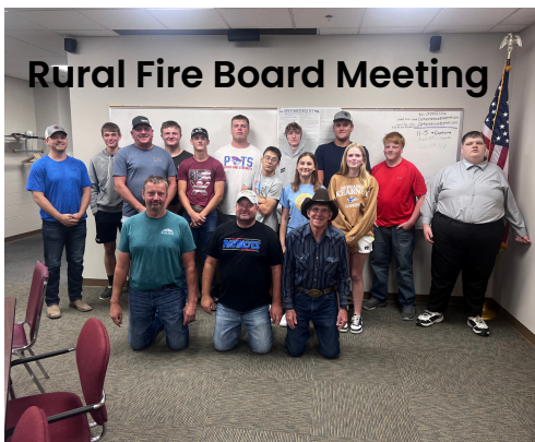
Rural Fire Board Meeting