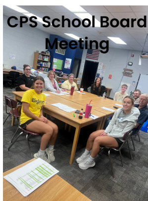
CPS School Board Meeting