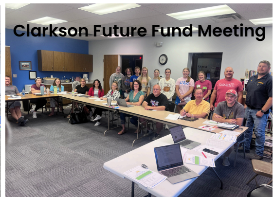
Clarkson Future Fund Meeting