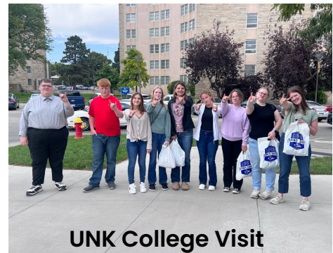
UNK College Visit